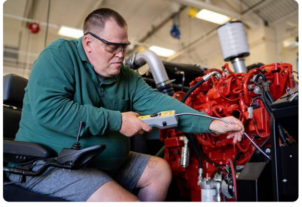
Long Beach City College